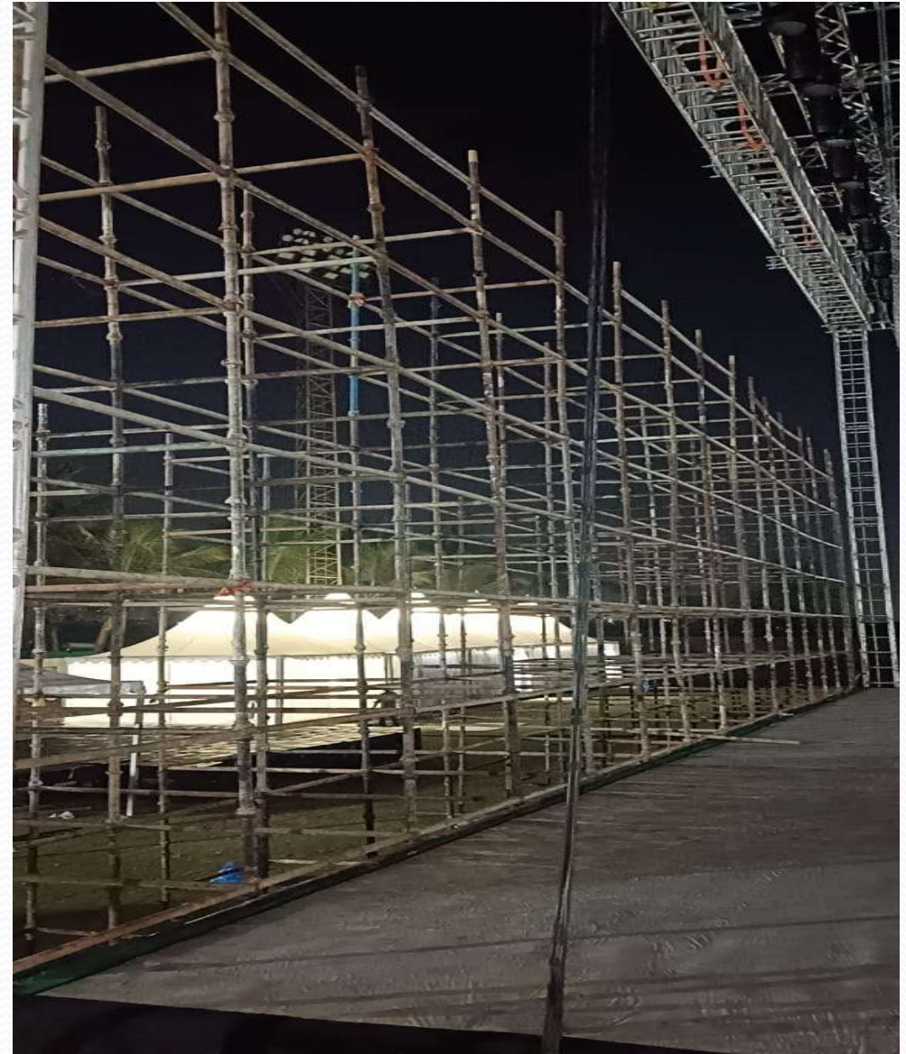
LED SUPPORT SYSTEM