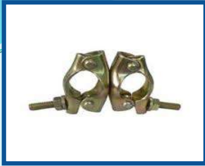
COUPLER SHEET METAL SWIVEL