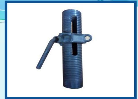
PROP SLIVE & NUT