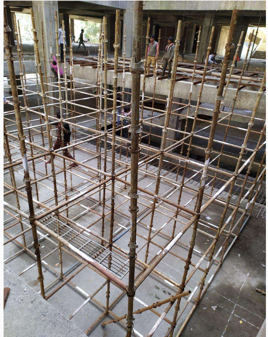
AR MALL, MOTA VARACHHA