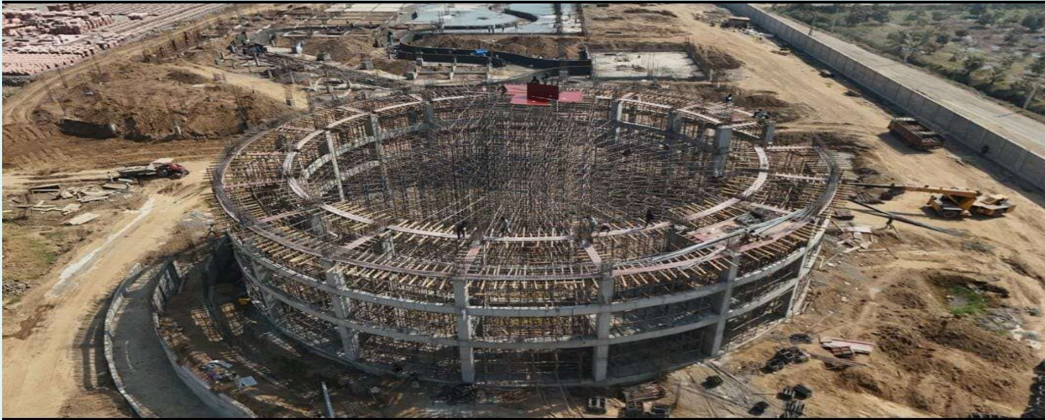
BAPS SWAMINARAYAN TEMPLE, KANAD,OLPAD