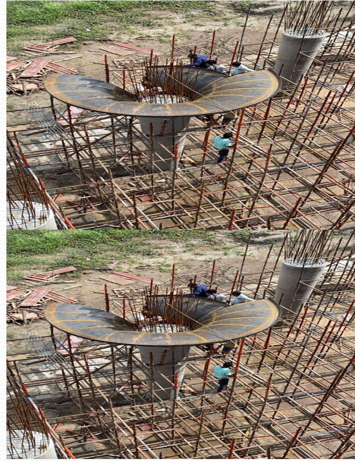
HIRA BURS, SURAT