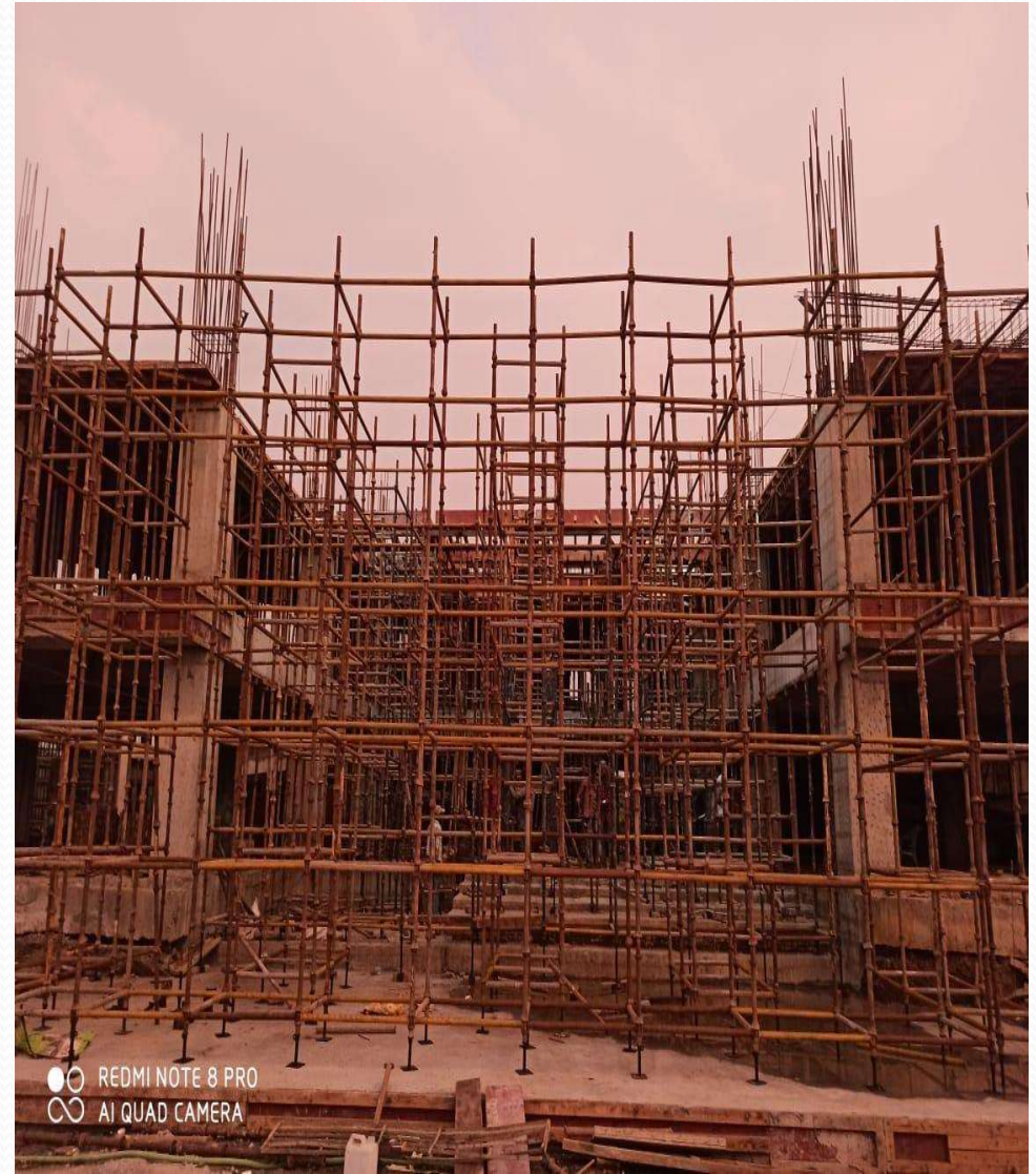
CHEMICAL FACTORY, ANKLESHWAR