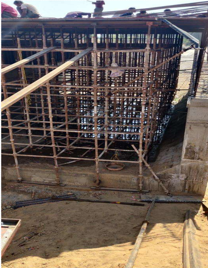
EXPRESS WAY BRIDGE