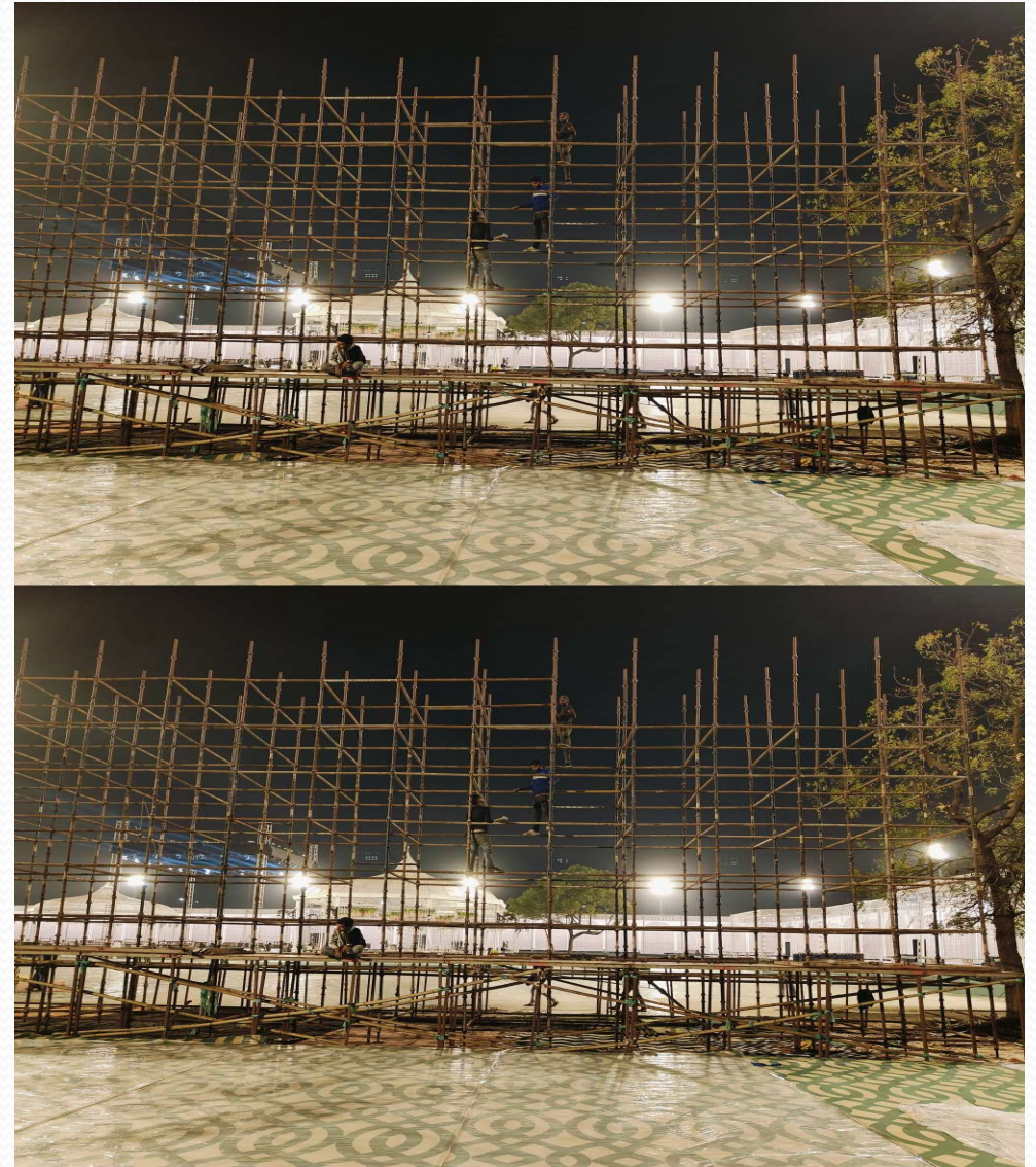
LED SUPPORT SYSTEM