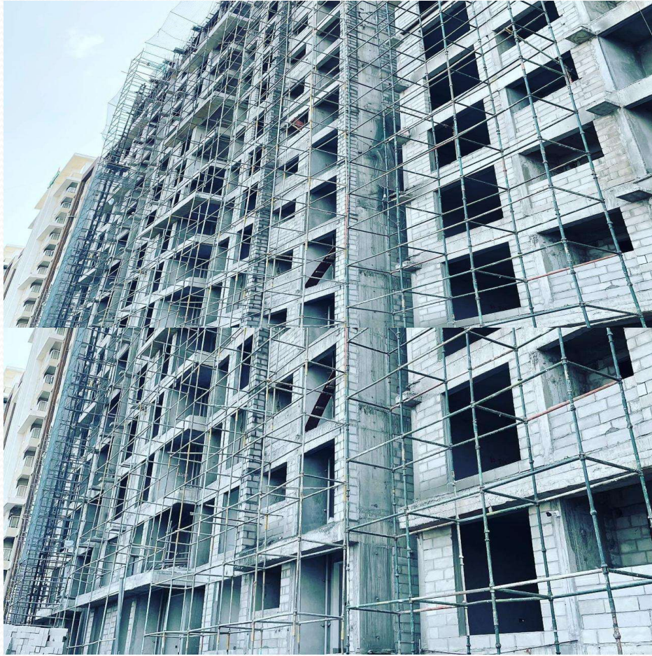
PLASTERING AT MADHYA PRADESH SITE