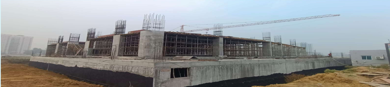
HAPPY MALL , VADODARA