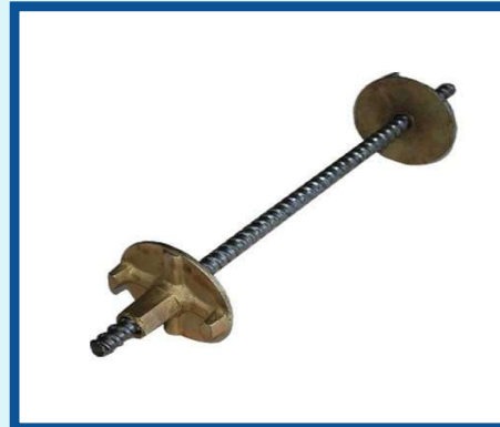
TIE ROD NUT