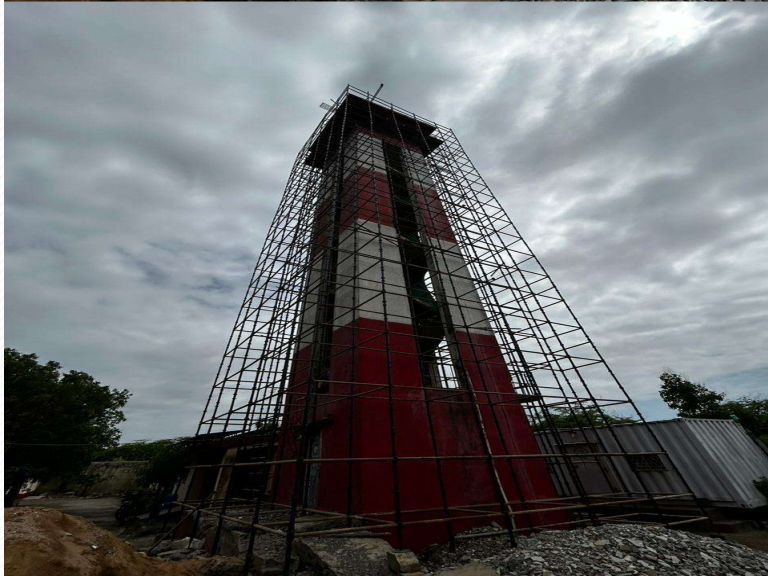
LIGHT HOUSE, DANDI BEACH