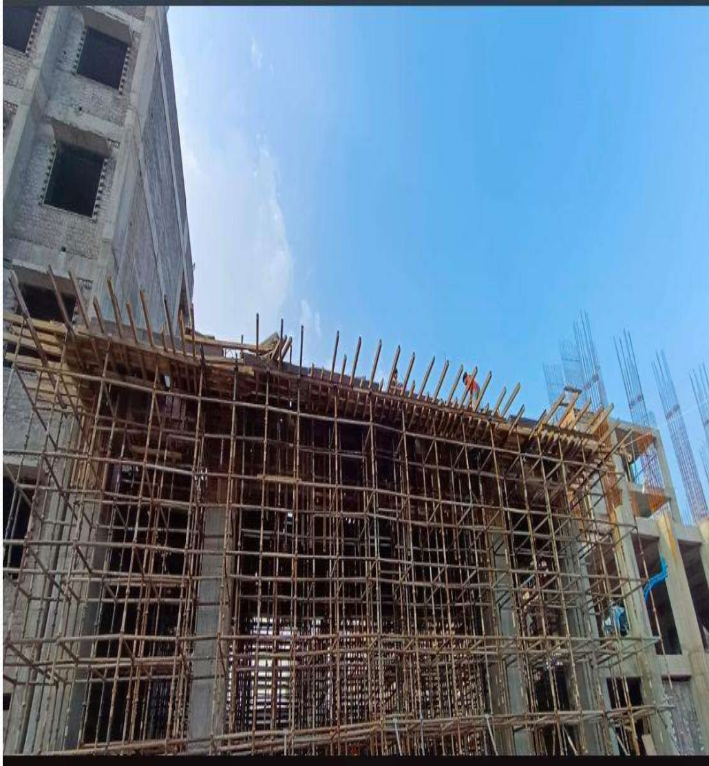
UDHNA RAILWAY STATION