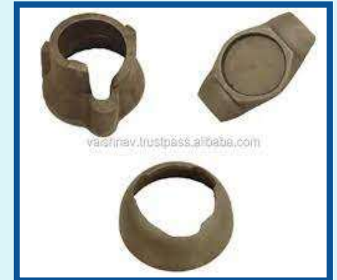
LEDGER BLADE, TOP CUP, BOTTOM CUP