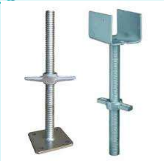
U-JACK & BASE JACK